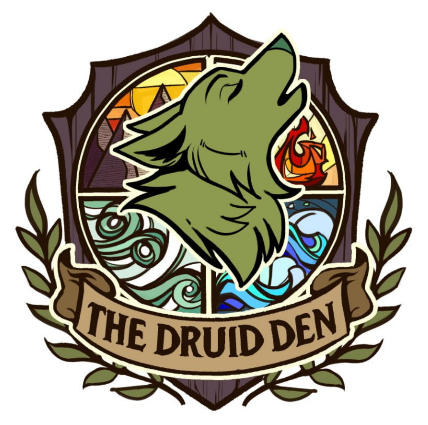
It's not where you walk. It's who walks with you.